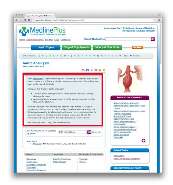
Figure 1 – A Screenshot of MedlinePlus "Health Topics"

A total of 76,012 referral letters and 2,118,463 other types of clinician notes are available in the corpus. We randomly selected 50,000 documents from each set to include in the analyses of this study. They are labeled as RL (Referral Letters) and N-RL (Non-Referral Letters), respectively, in the remaining parts of this paper.