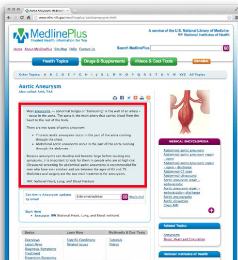
Figure 1 – A Screenshot of MedlinePlus “Health Topics”

A total of 76,012 referral letters and 2,118,463 other types of clinician notes are available in the corpus. We randomly selected 50,000 documents from each set to include in the analyses of this study. They are labeled as RL (Referral Letters) and N-RL (Non-Referral Letters), respectively, in the remaining parts of this paper.